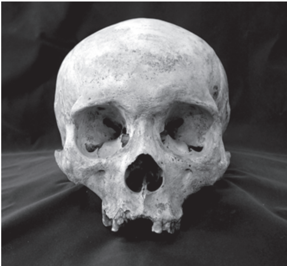
Figure 3. Cranium, individual 1948. Cráneo, individuo 1948.

The male (1948) (Figure 3) buried in tomb 50 was between 40 and 50 years old at death, an age at death that was typical for this area. He was accompanied by the fragmented remains of an infant of approximately 1.5 years of age with no observable pathologies or exclusive grave offerings. Paleopathological data reveal an individual with little evidence of stress. He had slight osteoperiostitis on his tibiae with no visible cause. Moreover, he also had osteoarthritic developments in his jaw with porosity and remodeling of both temporomandibular joints; these are in keeping with his age and the expected body use that he would have endured to this point. This pattern of degenerative joint disease was common in the adult portion of the sample, being visible in nearly 20% ( n = 18/92 ) of the individuals from this cemetery. This indicates a lifestyle in keeping with that of other members of his group.