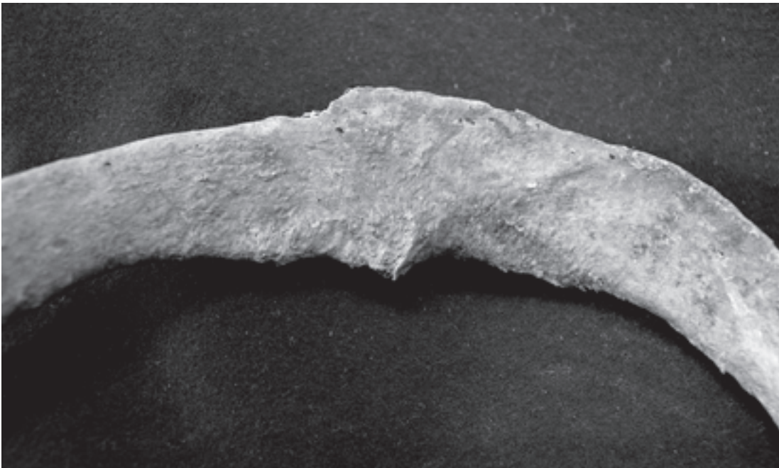
Figure 4. Healed fracture of left second rib, inferior view, individual 1948. Fractura cicatrizada de la segunda costilla izquierda, vista del inferior, individuo 1948.

In keeping with patterns of poor dental health in the Atacama, individual 1948 had lost 10 of his teeth 1 before death, showing evidence of substantial resorption and remodeling of the alveolar process. In the remaining 22 teeth he showed no evidence of calculus or abscesses and had only one large carious lesion on his left upper canine. Previous examinations of dental health at Solcor 3 show that 35% of the population had caries (Murphy et al. 1991). Moreover, more than half of the population suffered from antemortem tooth loss (52%) and abscesses were present in 7.4% of the population (Murphy 1993). Similar results were obtained from contemporary cemeteries (Kelley et al. 1991; Murphy et al. 1991). Against this back-