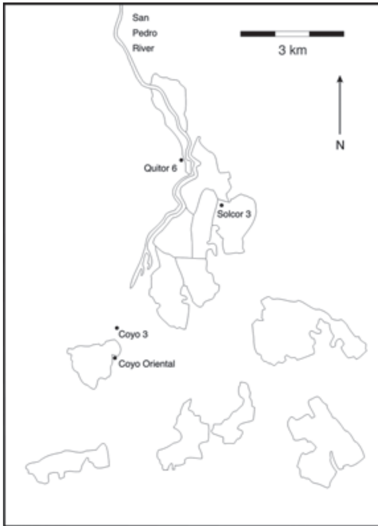
Figure 2. Map of the San Pedro de Atacama oases with sites mentioned in the text. Mapa de los oasis de San Pedro de Atacama con los sitios mencionados en el texto.

litical presence to the sharing of an iconographic system and occasional traders who caravanned across the altiplano (Knudson 2007; Knudson et al. 2004; Kolata 1993; Llagostera 2004; Oakland Rodman 1992; Torres-Rouff 2002; Torres and Conklin 1995). Through either of these mechanisms of interaction, it is likely that foreign individuals passed through or settled in the San Pedro oases.