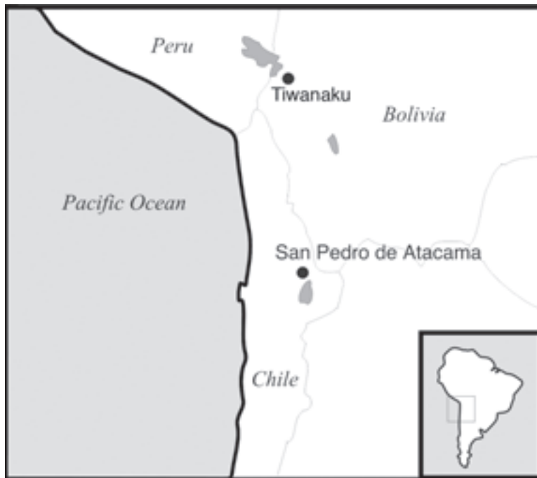
Figure 1. Map of the South Central Andes. Mapa de los Andes Surcentrales.

As part of a larger project investigating migration and the Tiwanaku state in the South-Central Andes (Figure 1), the second author examined strontium isotope ratios in numerous samples of dental enamel from three sites in the San Pedro de Atacama oases (Knudson 2007; Knudson and Price 2007). Strontium ratios of human tooth enamel reveal information about where a person lived during their childhood when enamel was being formed. Individual 1948 from Solcor 3 was one of the few outliers in this analysis, showing strontium ratios decidedly outside the range of the local San Pedro de Atacama strontium isotope signature. Given these data suggesting that this individual was originally from elsewhere, an examination of his health status, social role, and mortuary context provides us with a unique op-