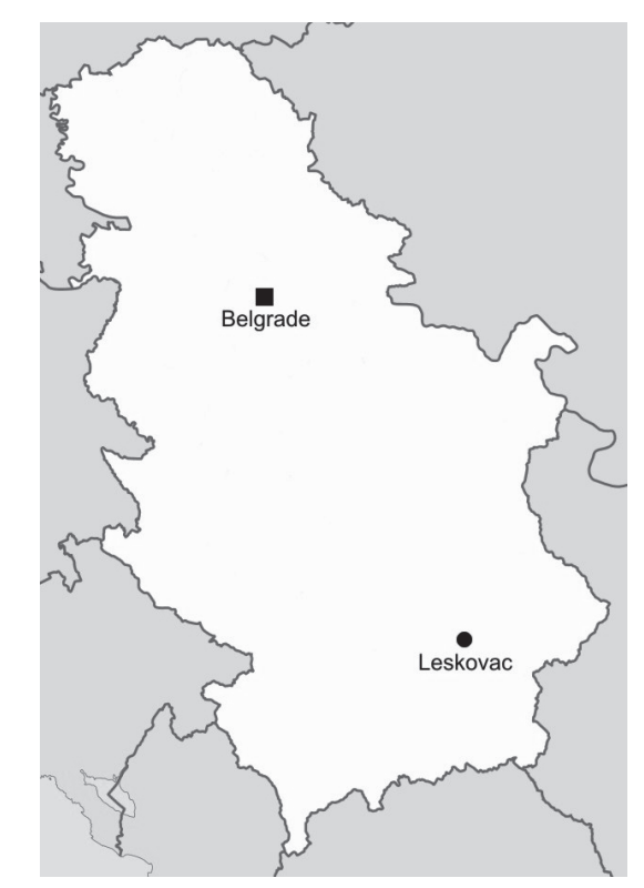
Figure 1. Location of the archaeological site. Localización del sitio arqueológico.

According to the preliminary archaeological report the cemetery was comprised of 29 graves. The estimated minimum number of individuals