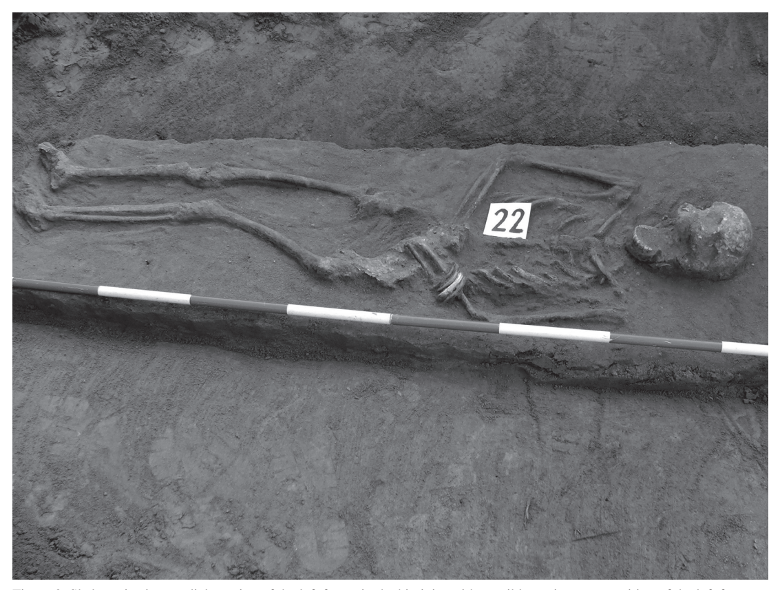
Figure 2. Skeleton in situ: medial rotation of the left femur in the hip joint with possible equinovarus position of the left foot. Esqueleto in situ: la rotación medial del fémur izquierdo en la articulación coxofemoral con posible equinovaro del pie izquierdo.